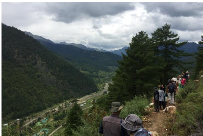
Haa Valley View Trail