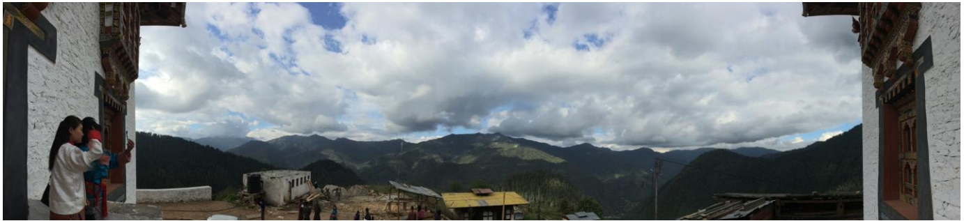
View from Takchu Goempa