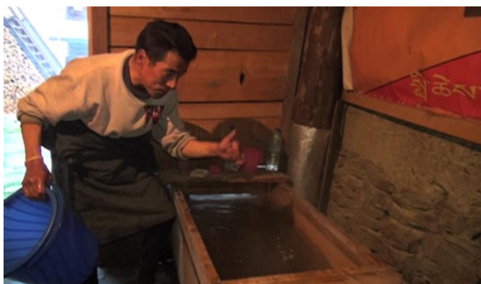
Hot Stone Bath (example)