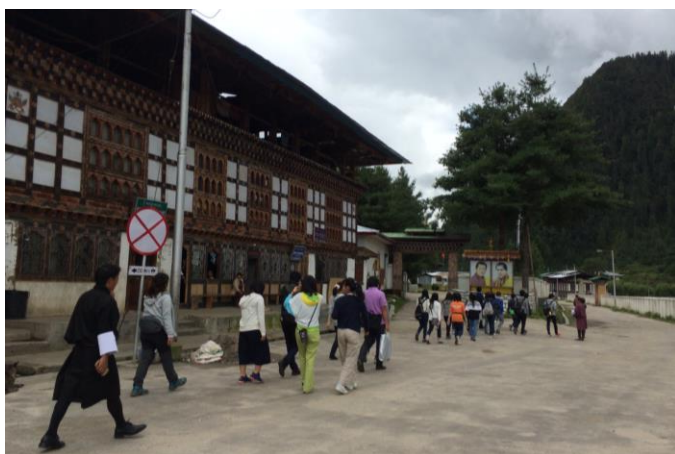
Haa Town Walk