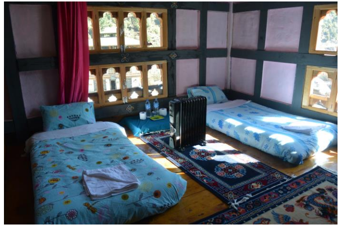
Village Homestay (example)