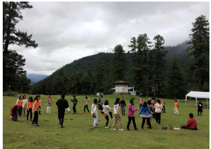
Ap Chundu Ground