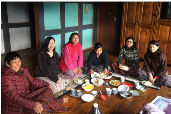
Lunch at Village Homestay (example)